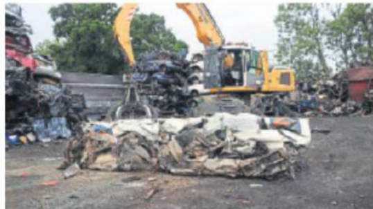
A still from the Fly tipping Group

"It's important that residents and businesses carry out the