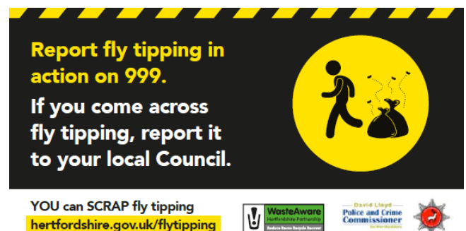
Fig 3 - Social Media example 2

6.6 In the meantime the FTGs local authority stakeholders have recently secured a number of high profile prosecutions as noted in Appendix A.