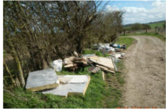
Rubbish dumped on Bygrave Road, Ashwell

As part of the Herts Fly-Tipping Group, all local councils in Hertfordshire work closely to deal robustly with anyone caught committing these offences.