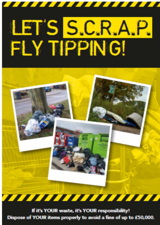
Fig 1 - The new household fly tipping leaflet

6.5 Examples of the new campaign literature are shown below: