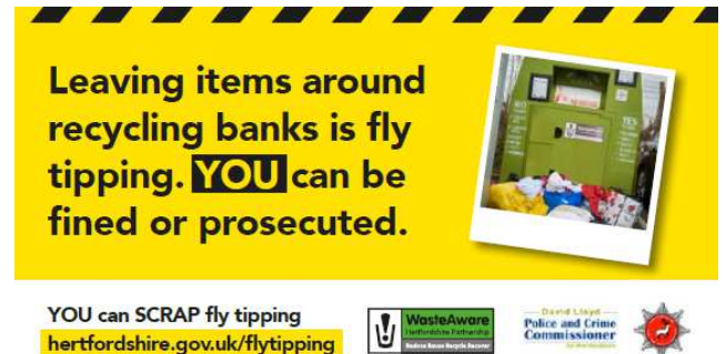
Fig 2 - Social Media example 1